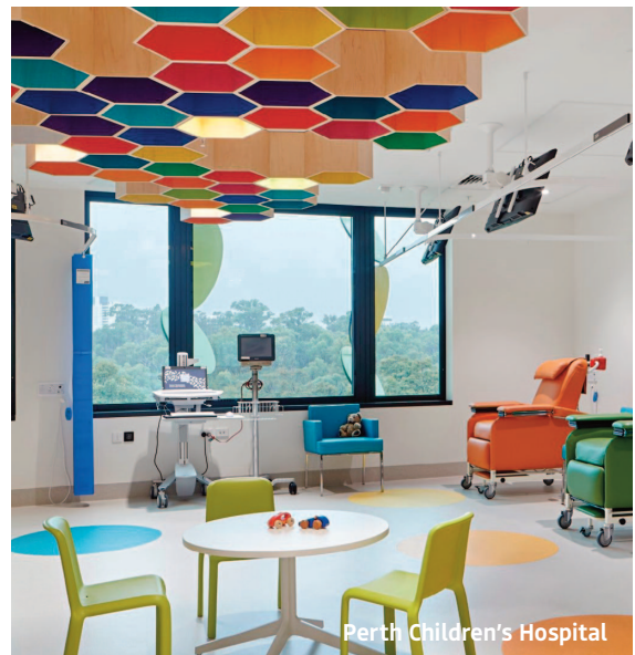
Perth Children's Hospital