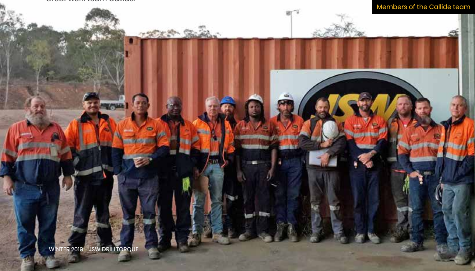
Members of the Callide team