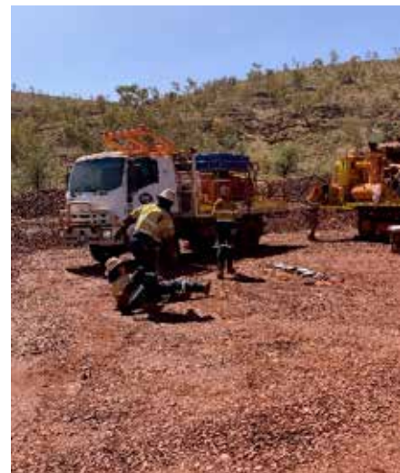
Solomon team mock emergency drill

PASSION COLLABORATION DETERMINATION SAFETY