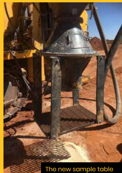
The new sample table

From the trials completed with Rig 10 this design has now been rolled out across the fleet.