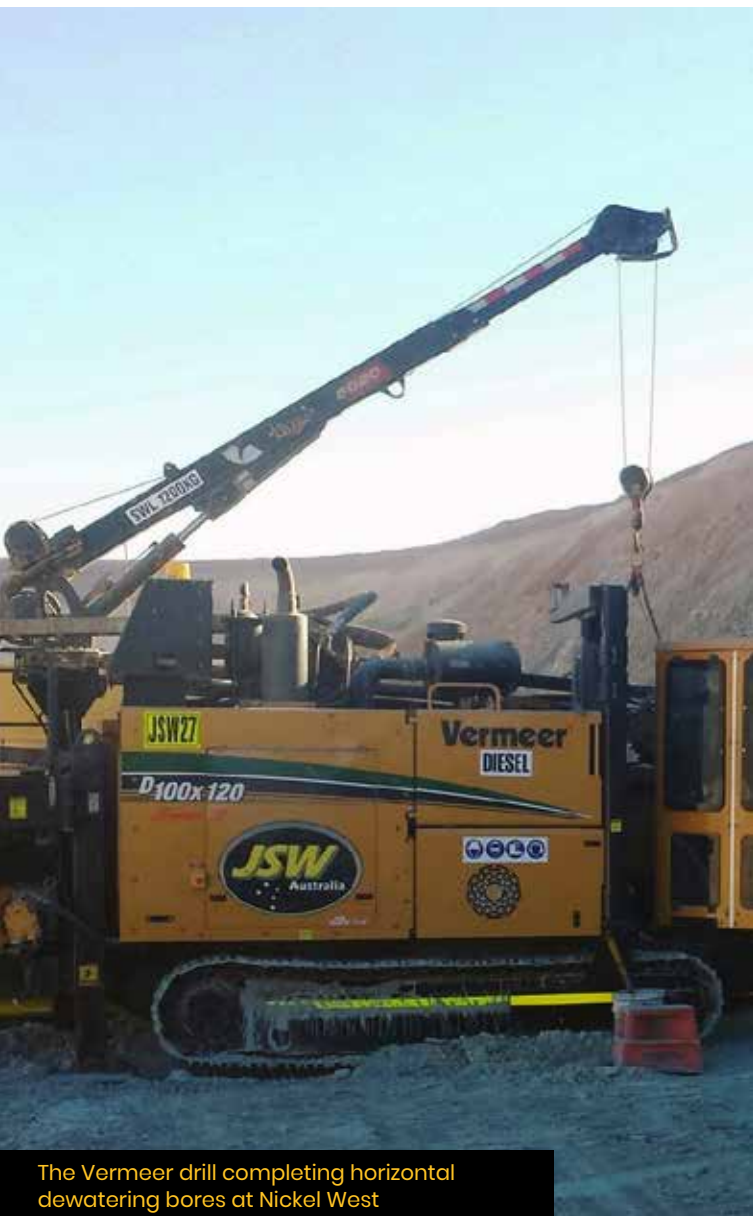
The Vermeer drill completing horizontal dewatering bores at Nickel West

Deep depressurisation bores drilled to up to 500m in gold, iron ore and nickel