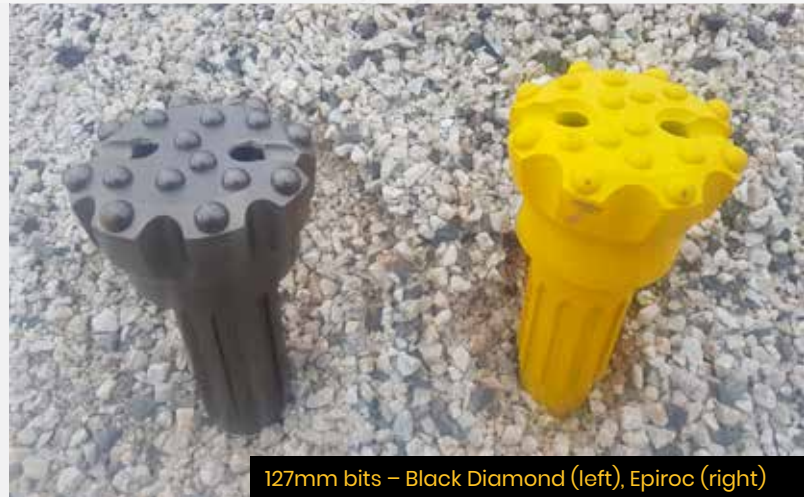
127mm bits – Black Diamond (left), Epiroc (right)