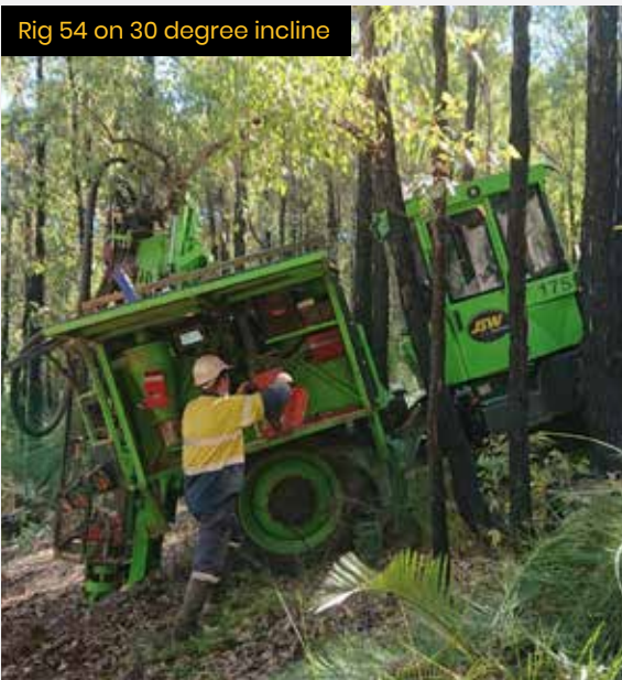
Rig 54 on 30 degree incline

The crews showed DETERMINATION and persistence to ensure that the work area was successfully drilled out.